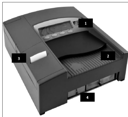
Figure 2 - M100 Optical Scanner

The AutoMARK voter assistance terminal (VAT) acts like a smart pencil. It supports assistive ballot marking for voters with low vision, voters who are blind, voters with limited dexterity or physical disabilities, or voters who want to read or hear ballot content in an alternate language. Voters navigate the ballot using the system touchscreen, physical keypad, or an ADA support peripheral such as a sip and puff device. The device visually guides the voter through the ballot marking process with screen prompts and symbols. Screen controls meet all applicable guidelines for size and readability. Physical keys are shaped and positioned to provide an intuitive voting session and labeled in both Braille and text to indicate function. The system includes a mandatory vote summary screen that requires voters to confirm or revise selections