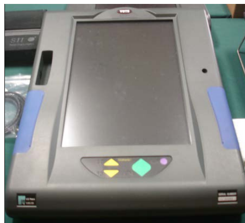
Figure 4 - iVotronic DRE

The iVotronic Direct Recording Electronic (DRE) is used in precinct polling places and early voting centers. Voters make selections from the electronic display/touch screen using a finger or device, such as a sip and puff or accessible tactical interface (ATI) designed to assist the target selection process. When the voter is finished voting, their selections are cast electronically for immediate tabulation. The iVotronic is capable of presenting the ballot to voters in alternative languages and has the ability to present an audio-only ballot, for visually-impaired voters. The audio only ballot presentation enables the voter review ballot content in an audio format through headphones. In this instance, the voter uses tactile buttons to navigate, select options and to cast the ballot. The iVotronic can also present a combination audio/visual ballot. This mode displays the ballot and, when screen objects such as race/proposition titles, race/proposition selections {candidate name, yes/no} are selected, reads selected items to the voter in an audio format, through headphones. Selections are made using the select button on the iVotronic tactile button array.