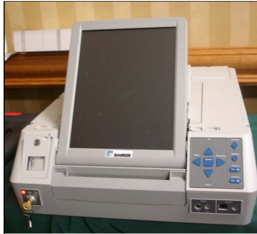
Figure 3 - AutoMARK (VAT)

prior to marking a paper ballot. Once the voter has marked the ballot, the voter removes the ballot from the AutoMark VAT and inserts the ballot into the precinct tabulator (DS200 or M100). If the AutoMARK VAT has the optional AutoCAST ballot box, the voter has the option to return the marked ballot to the voter and insert the ballot into the precinct tabulator or the option to cast the ballot directly into the attached AutoCAST ballot box.