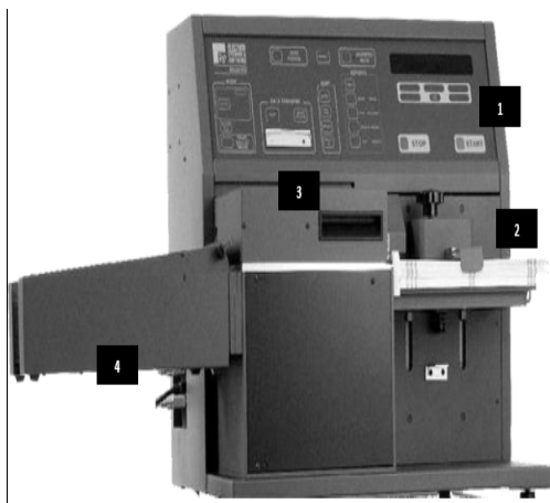
Figure 5 - M650 Central Count Scanner